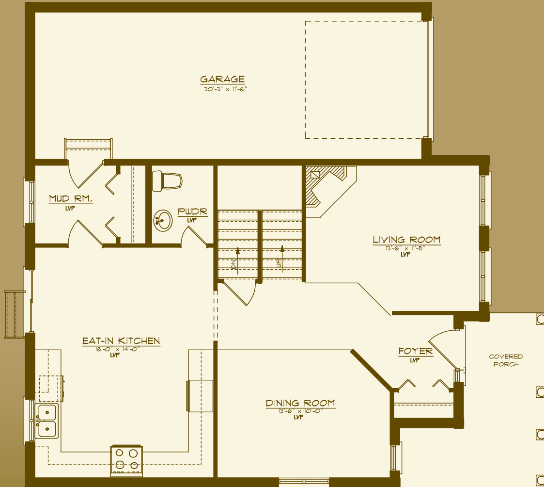
Main Floor 889 Sq. Ft.